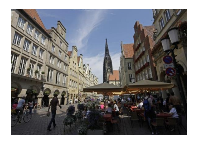
Münster Hansetor – Mainstation – project related Trend Study 2016