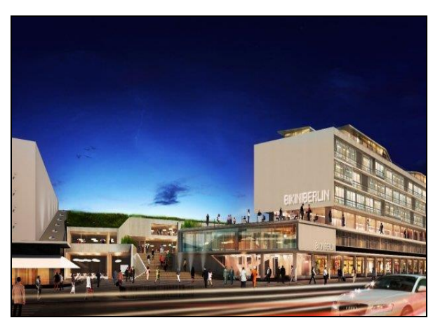
Bikini, Berlin, Adviser