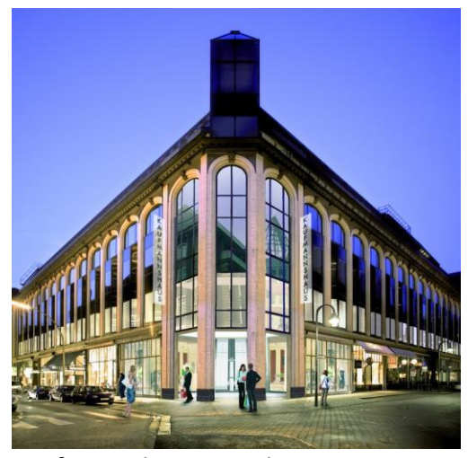
Kaufmannshaus, Hamburg, Project