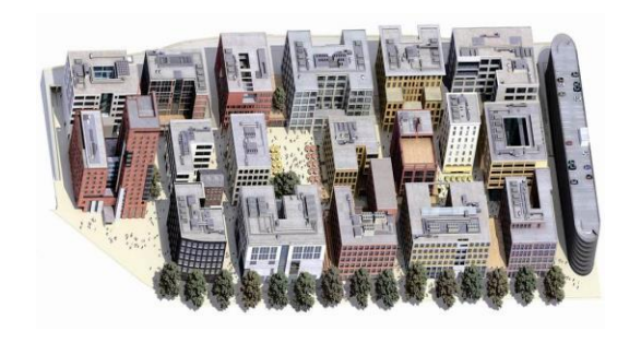
Stadtwerk, Frankfurt (Project)