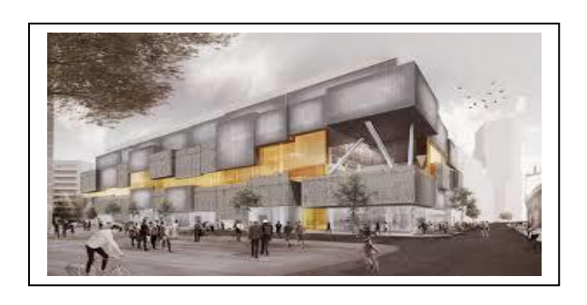
VOLT Berlin 2015, Utilization Mix, Adviser