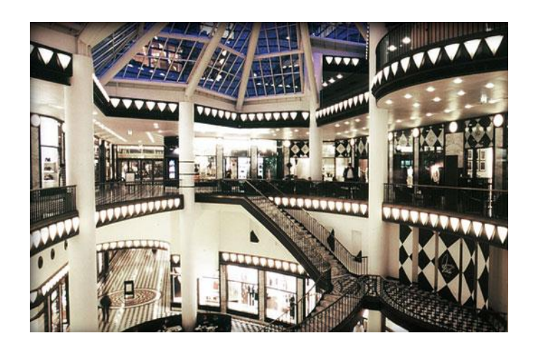
Quartier 206, Berlin, Adviser