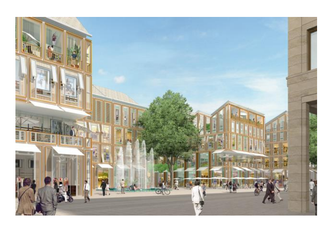
Stubengassen, Münster, Project