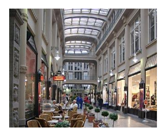
Maedler Passage, Leipzig, Adviser