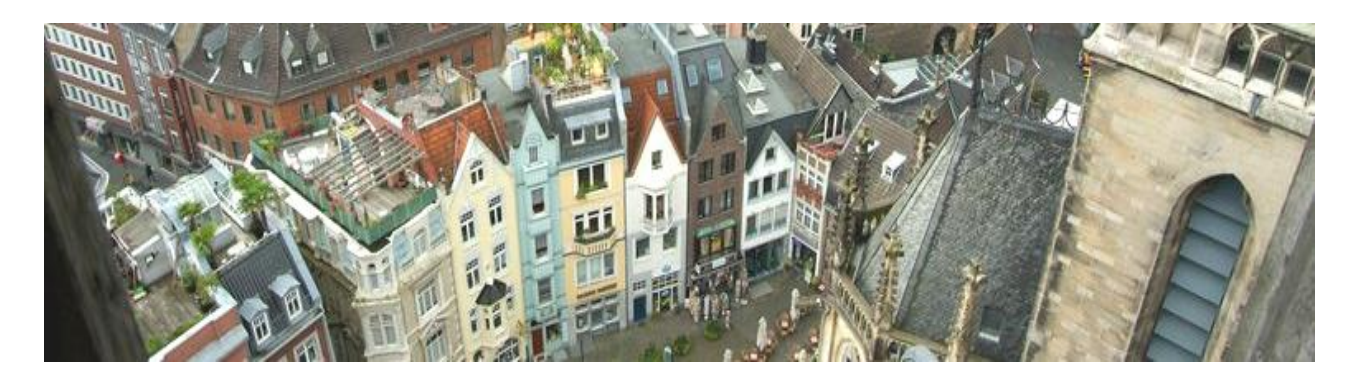
Aachen Old Town – project related trend study 2014 / 2016