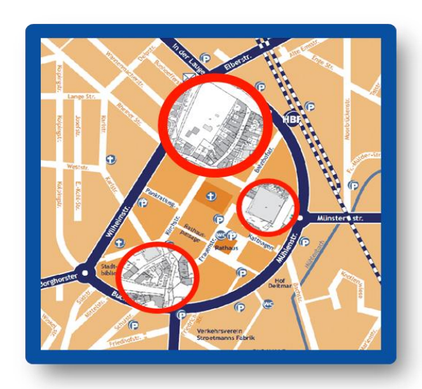
Emsdetten 2013 – Activation Process of Inner City