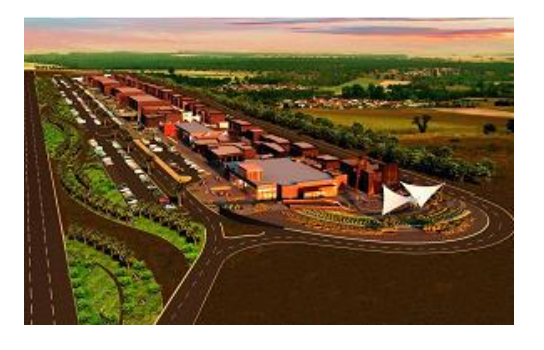
Designopolis, Cairo - Egypt, Adviser